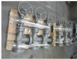
2"2500 Angle globe valve Italian, 16 weeks