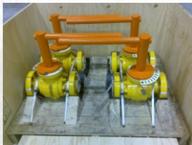
2"1500 subsea ball valves Italian, 14 weeks